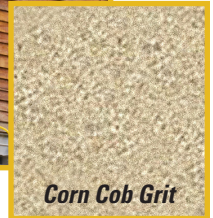
Corn Cob Grit